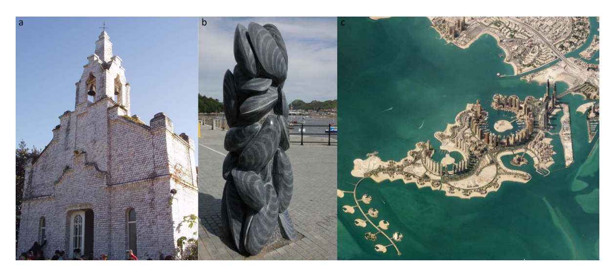
Figure 1 Examples of shellfish used in spiritual, emblematic or cultural contexts. (a) The shell church, covered in scallop shells at La Toja, Spain; (b) Sculpture of mussels in the mussel producing town of Conwy, Wales, UK; (c) Coastal development designed in the shape of an oyster: The Pearl, Oatar.

Bivalves have an archaeological and historical value, with empty shells found in midden piles which have been dated to between 8,000 and 7,000 years (Rollins et al. 1987; Roosevelt et al. 1991). Among the indigenous peoples of the Americas who lived on the eastern coast, they commonly used pieces of shell as wampum (small cylindrical beads strung together). The shells were cut, rolled, polished and drilled before being strung together and used for personal, social and ceremonial purposes as well as currency (Dubin 1999). The Winnebago tribe from Wisconsin had numerous uses for mussels, using them as utensils and tools. They notched them to create knives and graters and carved them into fish hooks and lures as well as powdering shell into