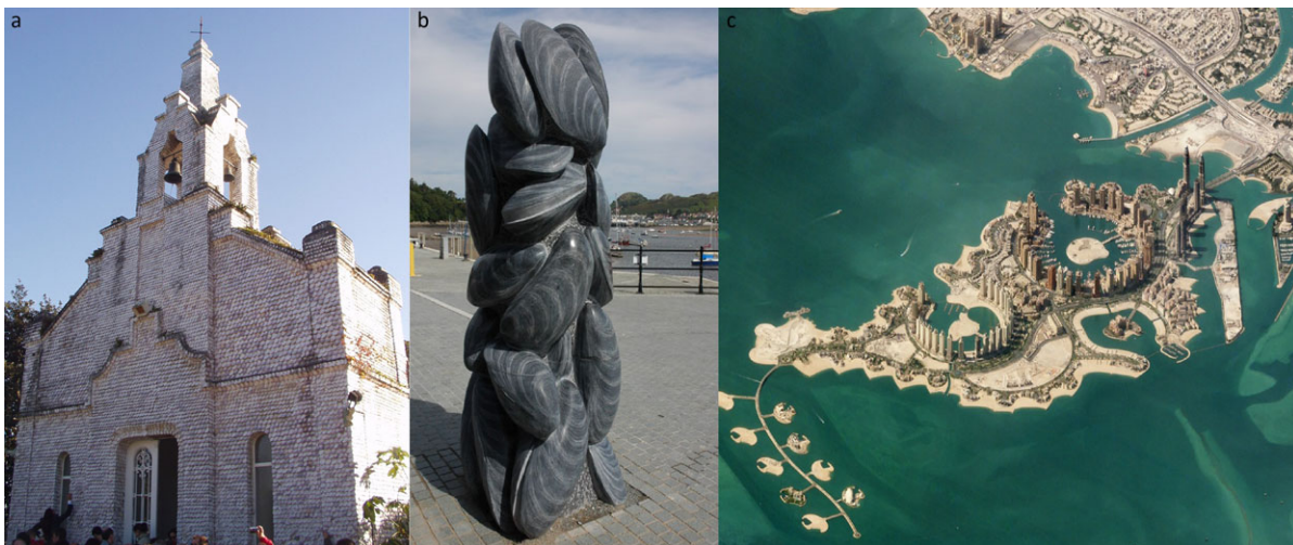
Figure 1 Examples of shellfish used in spiritual, emblematic or cultural contexts. (a) The shell church, covered in scallop shells at La Toja, Spain; (b) Sculpture of mussels in the mussel producing town of Conwy, Wales, UK; (c) Coastal development designed in the shape of an oyster: The Pearl, Qatar.

Bivalves have an archaeological and historical value, with empty shells found in midden piles which have been dated to between 8,000 and 7,000 years (Rollins et al. 1987; Roosevelt et al. 1991). Among the indigenous peoples of the Americas who lived on the eastern coast, they commonly used pieces of shell as wampum (small cylindrical beads strung together). The shells were cut, rolled, polished and drilled before being strung together and used for personal, social and ceremonial purposes as well as currency (Dubin 1999). The Winnebago tribe from Wisconsin had numerous uses for mussels, using them as utensils and tools. They notched them to create knives and graters and carved them into fish hooks and lures as well as powdering shell into